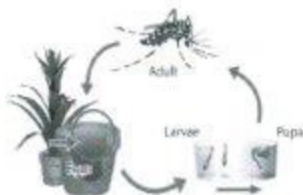
Mosquito life cycle – egg to adult in 7-10 days

Eliminate mosquito breeding sites NOW to prevent problems this summer!